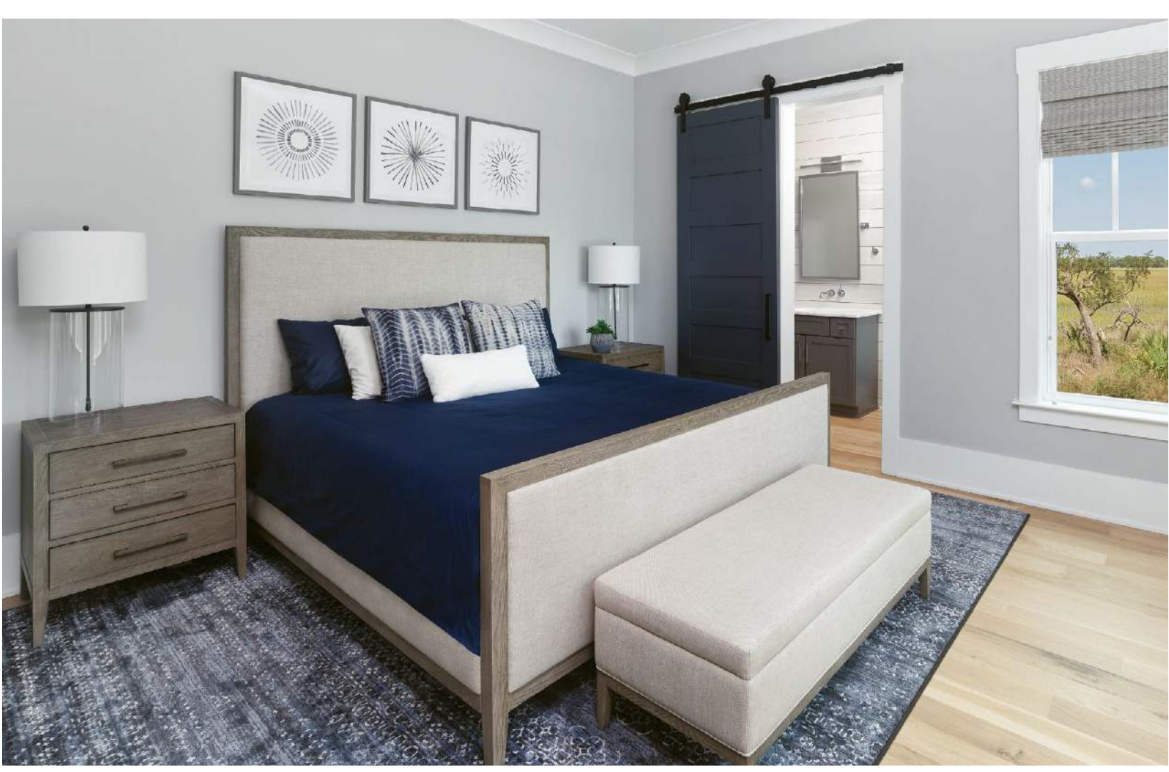
The main bedroom is just big enough to accommodate a bed and two nightstands. The adjoining walk-in closet is the same size as the bedroom.

left: A long double shower takes the place of the usual bathtub/shower combo.